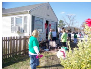
Outside Fairytales Photography