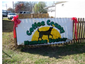
CCHS at Old Tullahoma Day Fairytales Photography Location