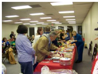
The Crowd Enjoying The Bounty

On December 16, 2010 CCHS had its first ever Christmas party. Food was supplied by CCHS, it’s members and by Coffee Café. Coffee (regular and decaf) was supplied by the local Starbucks. So we express our thanks to Coffee Café, Starbucks and our members for providing more than enough food.