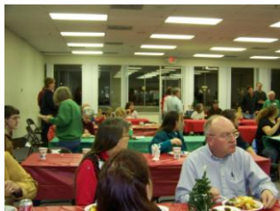
Everyone Enjoying The Food

Not only did we have enough food but we had a good crowd of over 30 people attending.