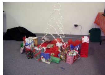
Grab Bag Gift Exchange under the Christmas Tree!

Not only did our leaders get gifts but all the members participated in a grab bag gift exchange. So each CCHS member had an opportunity to take home some small token of thanks, including 5 people who won Free Appetizer Gift Cards from Logan’s Manchester. Thank you, Logan’s.