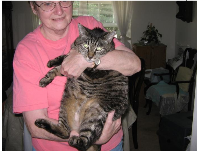
Who is this Cat?? Is she yours?

Donors for Upcoming Golf Event Needed!!! Step right up and Sponsor a Hole! Thursday August 4, 2011 Sponsor Fee $200 Co-Sponsor Fee $100 Call For Details